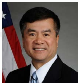
HONORABLE GARY LOCKE

JIN Liqun is Chairman of China International Capital Corporation Limited. He is member of foreign policy advisory committee of Chinese Foreign Ministry. Currently he also serves as Chair of the International Forum of Sovereign Wealth Fund. He has been active in international economic affairs for almost two decades, particularly since the Asian financial crisis in 1997. He has worked on a number of bilateral and multilateral economic and financial forums, such as the China-U.S. Joint Economic Committee, China-UK Economic and Finance Dialogue, APEC Finance Ministers' Meeting, ASEAN Plus Three and G-20. In addition, JIN was a past member of the State Monetary Policy Committee of the PRC.