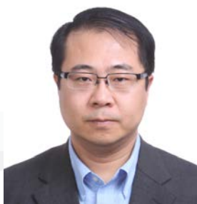
KE YAN GE Power & Water, Oil & Gas, Energy Management